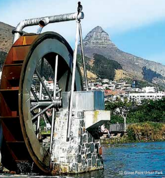
13. Green Point Urban Park